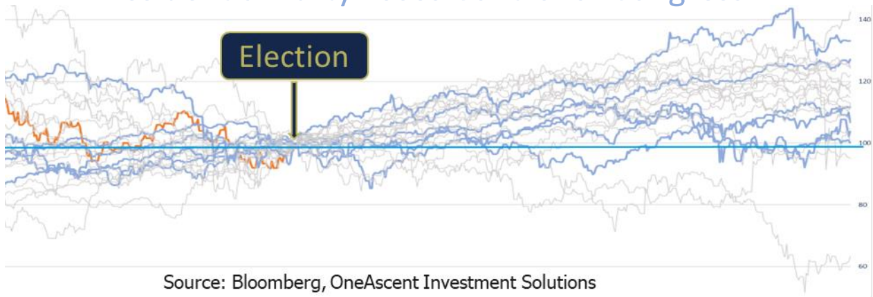
Source: Bloomberg, OneAscent Investment Solutions