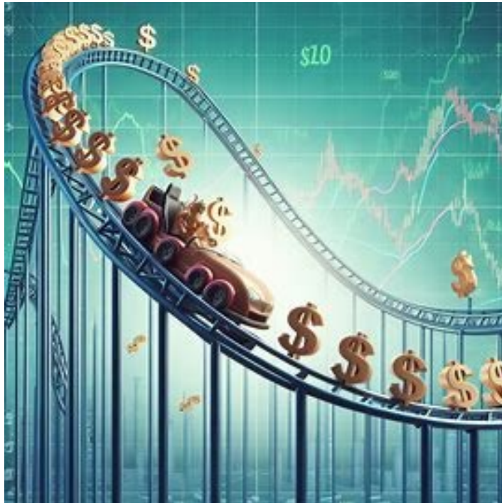
US Fiscal Deficit